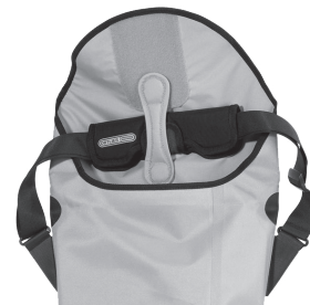
Internal view: fixing of shoulder strap while cycling