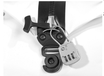
Wire loop for locking with padlock (padlock not included)